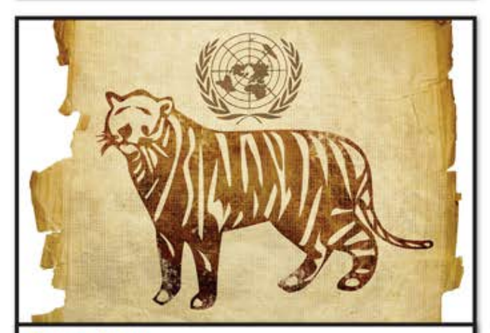
Paper tiger A COUNTRY OR ORGANISATION THAT SEEMS TO BE POWERFUL BUT ISN'T REALLY. "Their disastrous military campaign showed that they're just a paper tiger."

Feed/throw somebody to the lions IF YOU "FEED SOMEONE TO THE LIONS", YOU PUT THEM IN A SITUATION IN WHICH THEY CAN BE CRITICISED STRONGLY OR TREATED BADLY. "They asked me to give a speech on the proposed changes, but no one told me that people were so opposed to it. I really felt like I'd been fed to the lions."