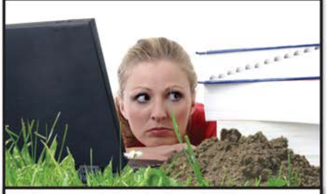
Make a mountain out of a molehill IF YOU "MAKE A MOUNTAIN OUT OF A MOLEHILL", YOU MAKE A MINOR ISSUE APPEAR TO BE A VERY SERIOUS PROBLEM. "You did one bad exam. Stop worrying about it. You're making a mountain out of a molehill." [A mole is a small animal with black fur.]

Badger someone TO ANNOY SOMEONE BY REPEATEDLY ASKING THEM A LOT OF QUESTIONS. "I left my job three months ago, but since then they've been badgering me to go back."