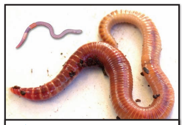
Bookworm SOMEONE WHO LOVES READING BOOKS AND WHO READS ALL THE TIME. 'She's a real bookworm - she reads everything and anything whenever she can."

The early bird catches the worm IF YOU WANT TO BE SUCCESSFUL, YOU SHOULD DO SOMETHING IMMEDIATELY. "If you see an apartment you want that's advertised in the classified section of the newspaper, you should get in touch with them as soon as possible. As they say, the early bird catches the worm."