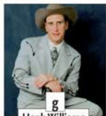
g Hank Williams