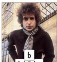
b Bob Dylan