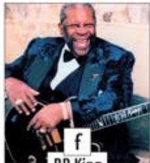
f BB King