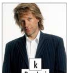
k Bon Jovi