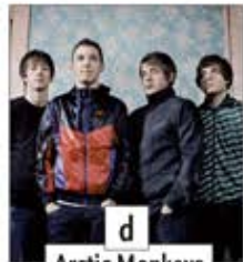
d Arctic Monkeys