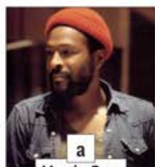
a Marvin Gaye