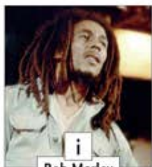
i Bob Marley