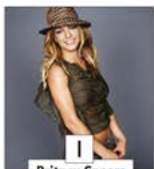
l Britney Spears

Can you think of any musicians or bands for these types of music: hip hop, punk, ska, electronic, rap, soul, Brit pop, new R 'n' B, jazz? Other?